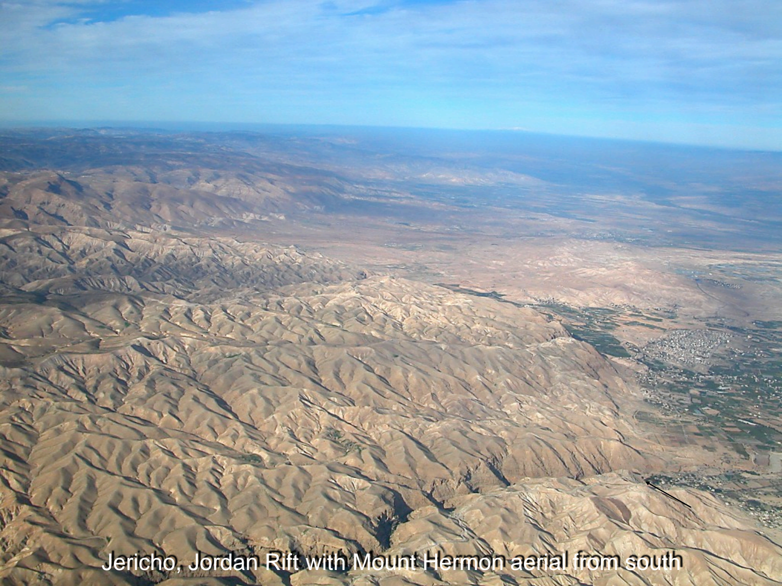
Jericho, Jordan Rift with Mount Hermon aerial from south